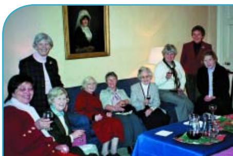
Enjoying a hot toddy and mince pies at the Georgian House, Edinburgh

With best wishes to you for a relaxing summer.