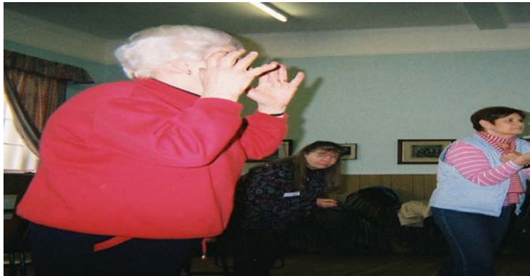
Figure 5 – co-participants taking part in the workshop day

Samba is traditionally an intergenerational activity in its native setting. In our workshop, we will be creating samba-inspired movement in tandem with the musicians. Participants will learn some authentic samba steps which can form the basis of a dance, and they will have the freedom to build on to it their own ideas, inspired by the spirit of samba. By the end of the workshop, we aim to be able to dance a short routine to the musicians' accompaniment.