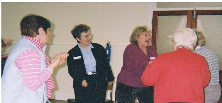
Figure 4 - co-participants taking part in the workshop day

Games are widely used by actors and directors to develop story, plot, action and imagery. This workshop is designed to offer an introduction to devising short scenes using games as a starting point. The emphasis in all the activities is on playing, having fun, on not ‘getting it right’.