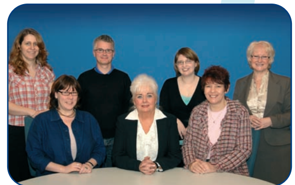
The COPA Team

Scotland. We all had great time at a recent ESRC Seminar entitled Planning for the End of Life, a title which does not