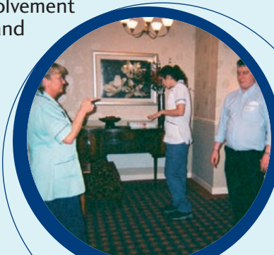
Staff drama workshop – example of a physical image