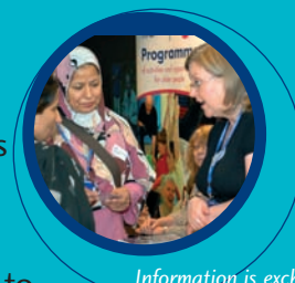
Information is exchanged by the many exhibitors

Members of the HUB can join in a number of COPA activities or attend meetings and events on behalf of COPA. We hope to be able to develop a number of courses to enable members to become skilled in certain areas and have begun this with the Taster Research Course. A Research Skills course has also been piloted and will be offered in the Autumn. It is up to HUB members whether or not they become involved or whether they use the HUB just to be kept informed of current debates.