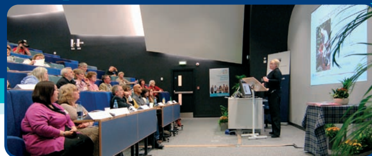
COPA hosts the successful SCIP roadshow in our new lecture theatre at QMU

More information is available on the SCIP website at http://www.scotcip.org.uk/home.html