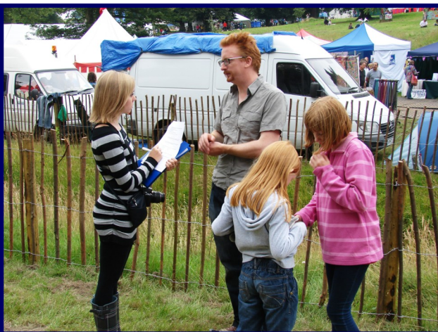
Centre student researcher interviewing guests at The Big Tent festival in Fife as part of Celebrating Fife 2010 research study.