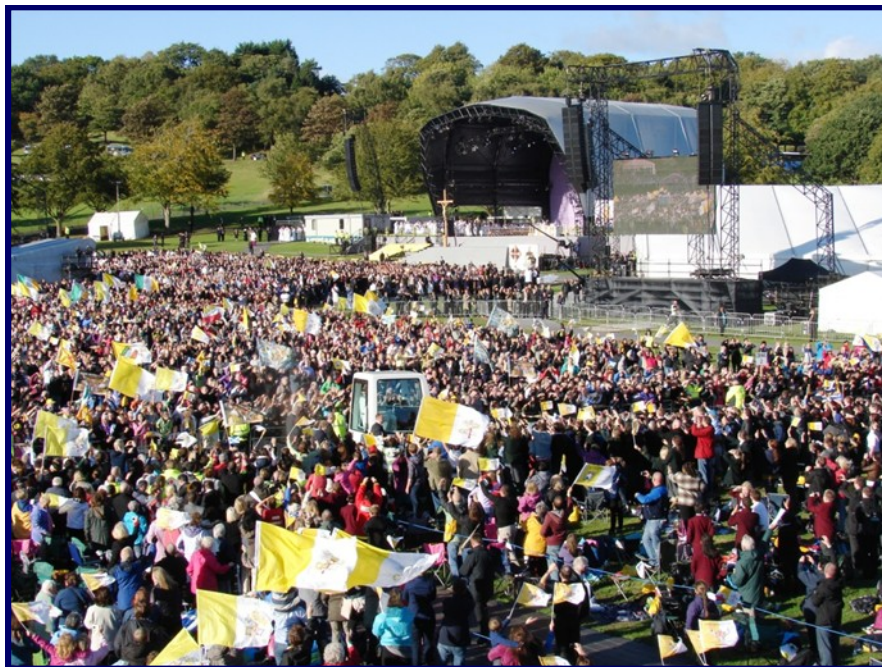
Papal Visit Research 2010 Impacts and Well-Being Research Study.

Each project that the Centre is involved in is managed by a team of professional researchers selected from the most qualified academic and professional experts at Queen Margaret University, Edinburgh.